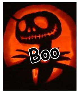
Halloween is coming, get ready for trick or treat

this has been one of those months where the time has just gotten away from me. I have been on the move most of the month and as you read this I will be in Los Angeles scrambling to meet other deadlines. I have promised myself I'll get the newsletter