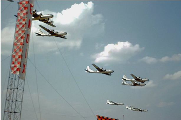
B-29 flight at the 1949 Cleveland Air Show