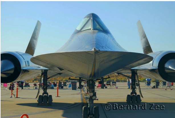
SR-71 Blackbird at the 2009 Edwards AFB Open House (it's now blue, not black)