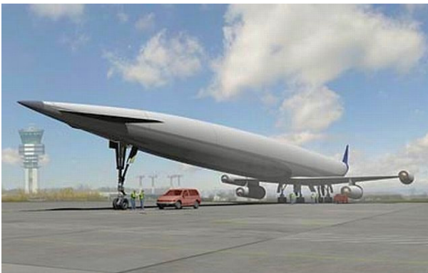
... and in future? Proposed hypersonic transport