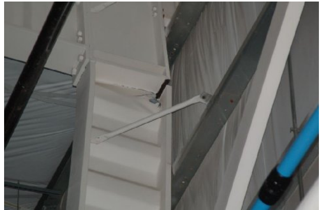
Snow can do this?