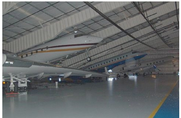
... and as a result, this...