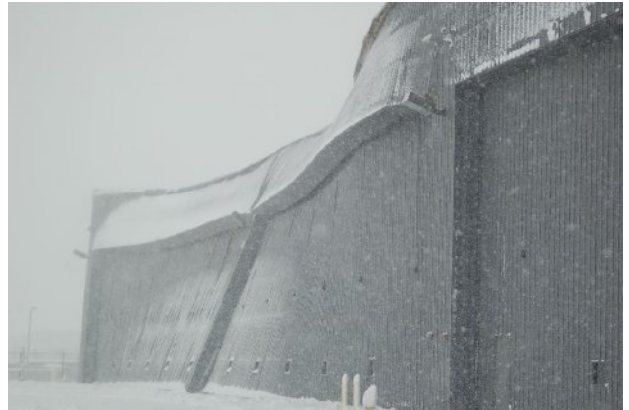
The blizzard that shut down Washington DC also collapsed this corporate hangar at Dulles International