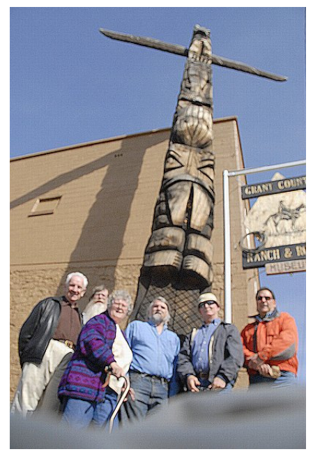
Unfortunately, the Museum was closed