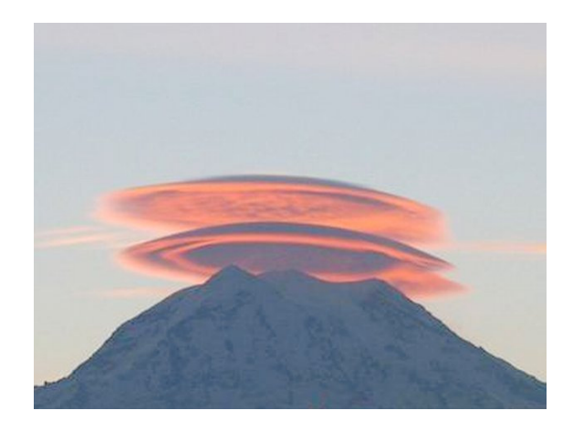
Another kind of light show ... from underneath