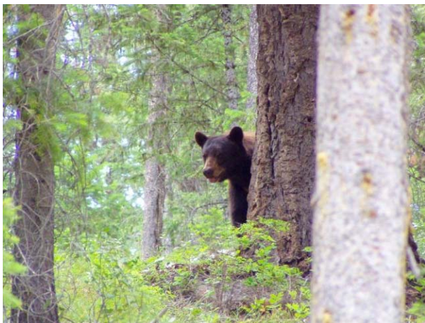
Non-COOPA visitor at the Big Creek Lodge

The Leckliders and the Wilfongs went over a day early and flew into Big Creek and spent the night ... what a beautiful place it was ... very relaxing, the food was good and we really enjoyed ourselves. I did take a few photos at Big Creek to let you see how nice it is.