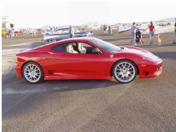
..... and this one's mine (I wish!)