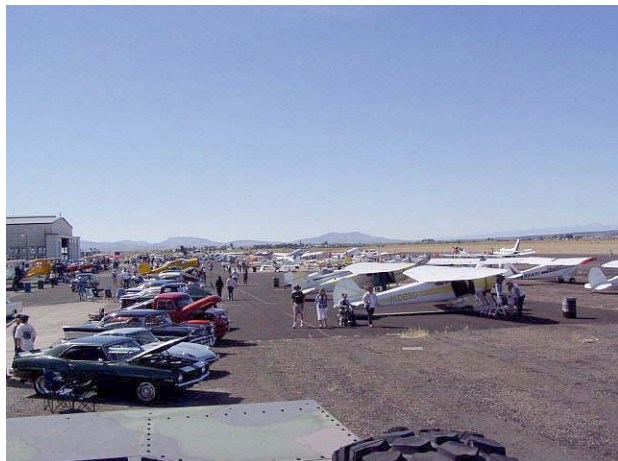
Lotsa planes and classic cars at S33