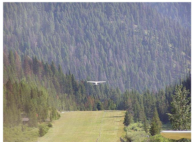
Taking off from U60

Put Big Creek on your list of great places to fly .... they do have a camp ground adjacent to the airport if you choose to camp... Don Wilfong