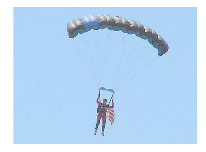
.... More later ...