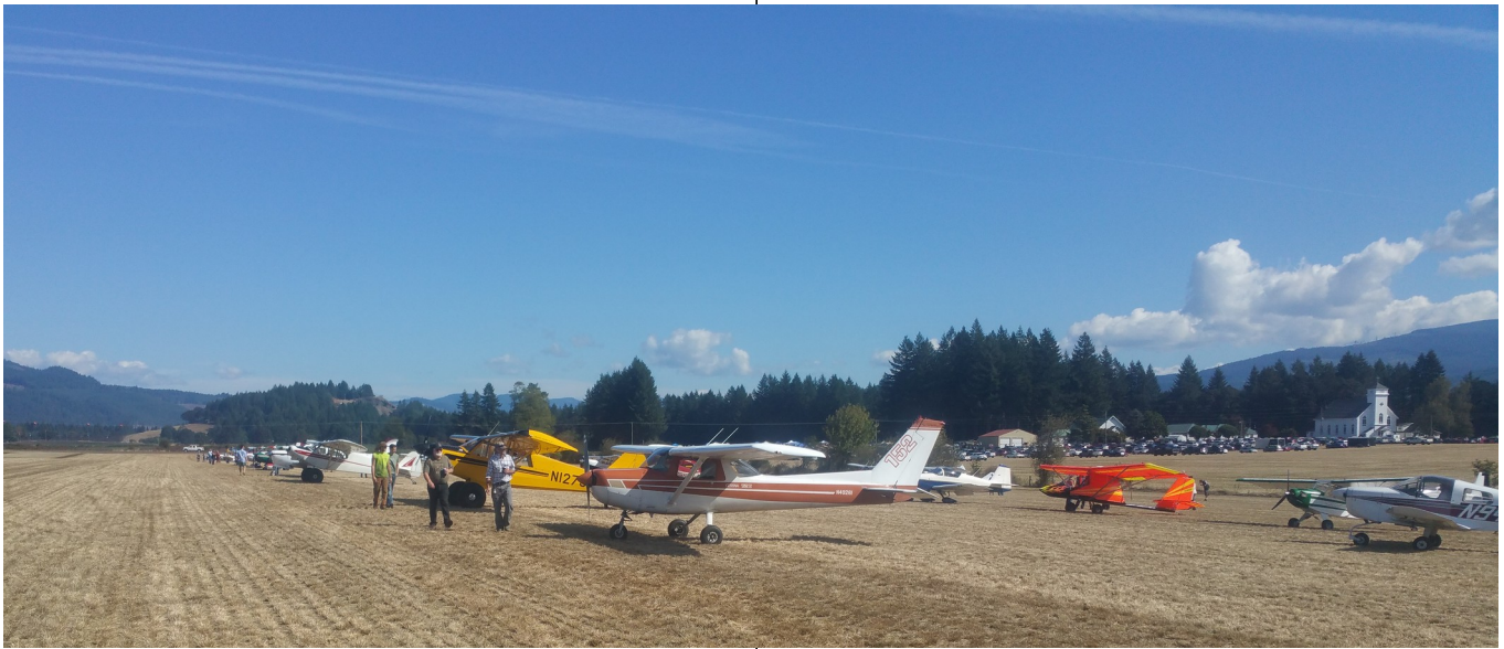
Gillette Airport, Jordan Chicken Run